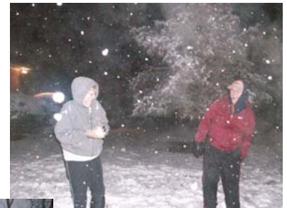
Pres & Mrs Smith rise to students' challenge.

Cameras captured the excitement, showing faces wreathed in big smiles or full of laughter as well as moments of quiet wonder as students and adults alike surrendered to the child in their hearts.