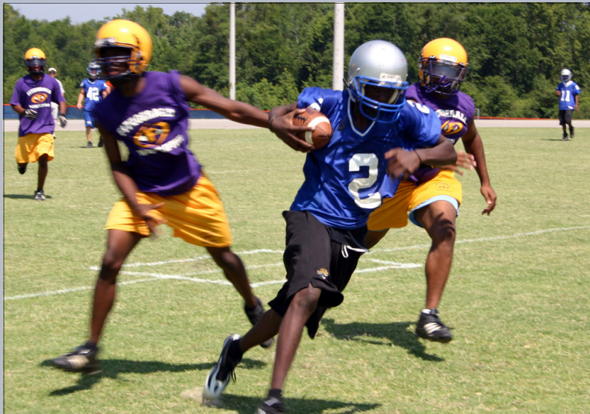
A MONTGOMERY COUNTY HIGH SCHOOL RECEIVER OUTRUNS TWO FITZGERALD HIGH SCHOOL HURRICANE DEFENDERS DURING A SEVEN-ON-SEVEN PASSING GAME FORMATION LAST WEEK DURING THE FCA PASSING CAMP HELD ON THE MOUNT VERNON CAMPUS JUNE 21-23.