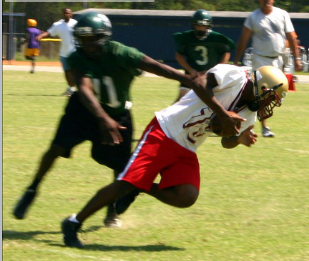
A VIDALIA HIGH SCHOOL RECEIVER CATCHES A PASS DURING THE INAUGURAL FCA PASSING CAMP CO-SPONSORED BY FIRST BAPTIST CHURCH OF VIDALIA.